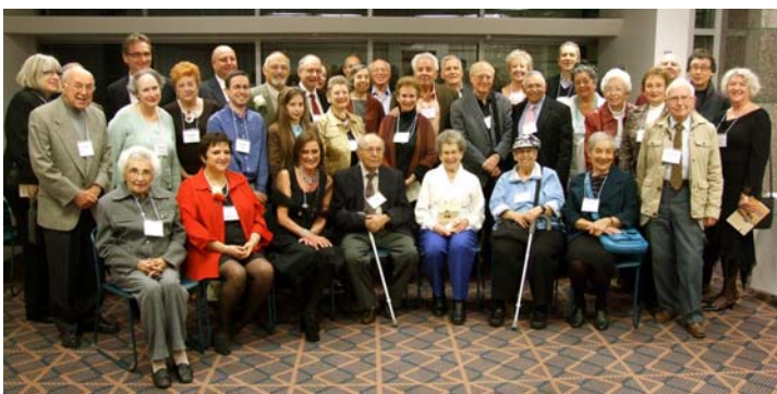
Our distinguished authors