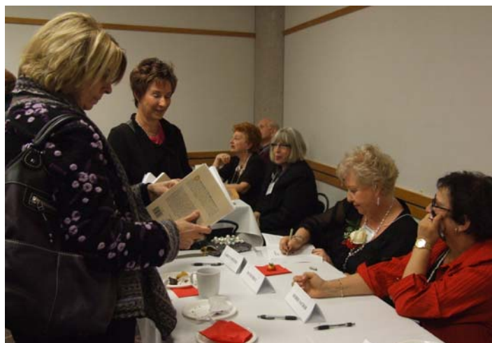
Autographs from authors