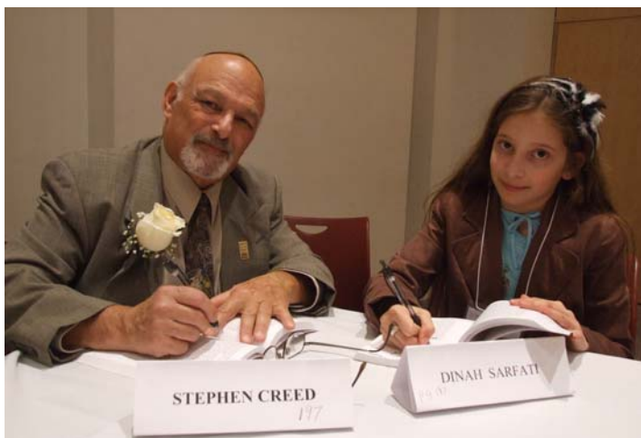
Proud grandfather with granddaughter, co-authors