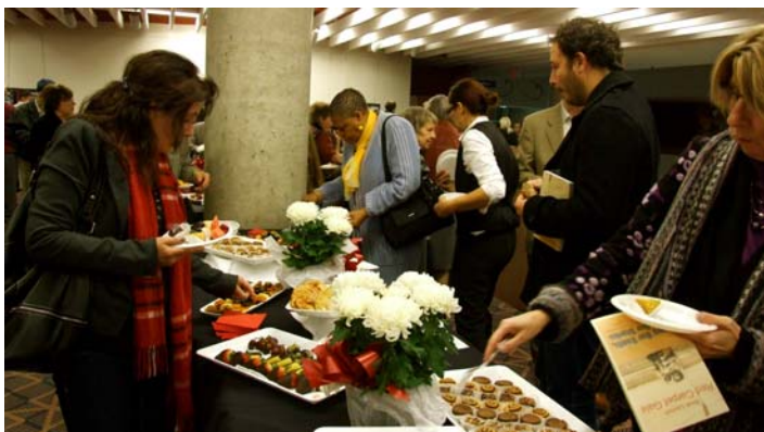
A sumptuous reception buffet