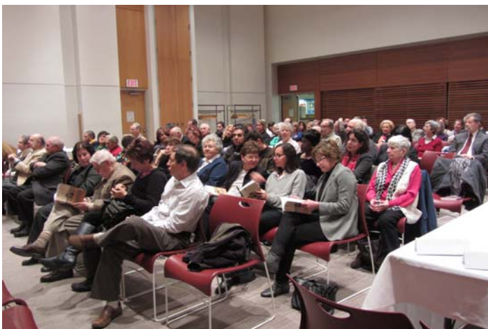
An appreciative audience awaits the arrival of the authors