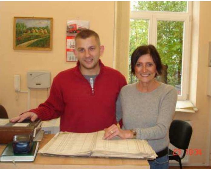
Author and Clerk with Archive Books