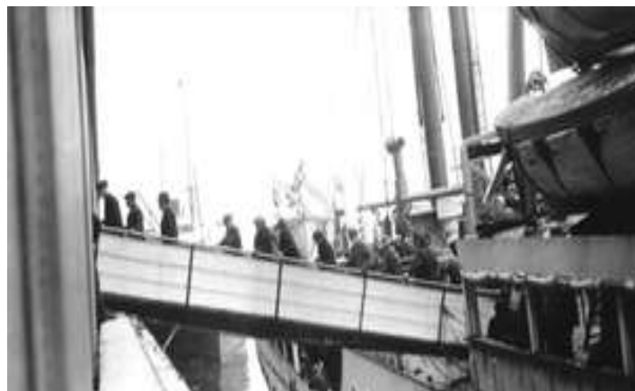
New arrivals disembarking ship

For enthusiasts of genealogy, Pier 21 is a must-visit on any forthcoming vacation to the Maritime Provinces. The website of the Pier 21 Museum offers a valuable ship arrival database: http://www.pier21.ca/